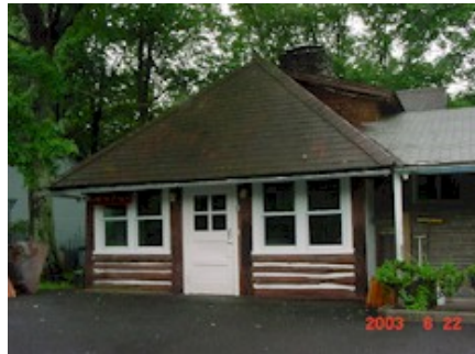
Zen Meditation Center