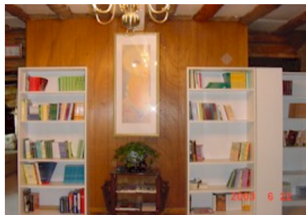
A picture of Amitabha in the Library

The Second Gate is the gate of praise. We should praise Buddha while we recite Amitabha's holy name.