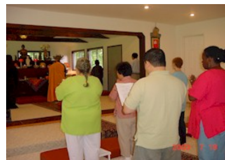
The Great Compassionate Confession Ceremony on July 19, 2003

In our lifetime, it is not so easy to be able to sit down to recite Buddha's name or meditate for one hour. We should hold on to this opportunity of keeping the Eight Precepts for one day and one night. Utilize this short period of one day and one night to practice diligently. With a pointed mind, there is nothing that we cannot achieve. Just concentrate our mind here to do the things that we should do and to practice the Dharma that we should practice.