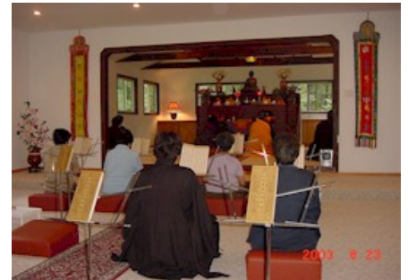
Recitation of the Sutra of Bodhisattva Ksitigarbha's (Earth-womb)