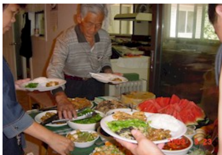
A great meal for lunch