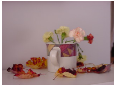
We may give the flowers different names, but they are still colorful.

modes of relying, according to the Buddha Dharma: relying on the Dharma not the person, relying on the Sutra describing ultimate truth not the Sutra describing relative truth, relying on the meaning not the words, and relying on the wisdom not the consciousness. The first one, relying on the Dharma not the person, teaches us to follow the Dharma not the person. Practitioners should follow the teaching not the person. Even when a person is an ordinary being or a non-Buddhist, if his or her speech matches the pure Dharma, then we may follow. On the other hand, if a person has all the good marks as Buddha but his or her speech does not match the pure Dharma, then we should leave and do not follow.