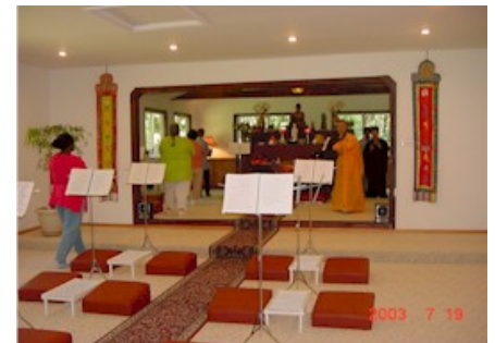
Circling the Buddha during the Great Compassionate Confession Ceremony

Practicing the Buddha Dharma should be like air, which is neither empty nor existing. In order to benefit the sentient beings through practicing Bodhisattva's Path, our practice should be formless as air, serving the sentient beings quietly. It is a great merit and good Karma root to practice Buddha Dharma while we are healthy. Be thankful to the Bodhisattvas who grant us a healthy body so that we can recite Buddha's name. We should recite Buddha's name with gratitude and a sense of rare chance. While practicing in this human world, sometimes you will encounter obstacles that could help your practice progress and increase your merit. You should practice diligently if you want to benefit the sentient beings within your limited life.